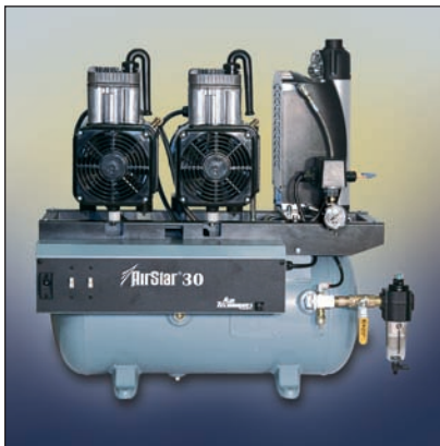
AirStar 30 with Membrane Dryer System