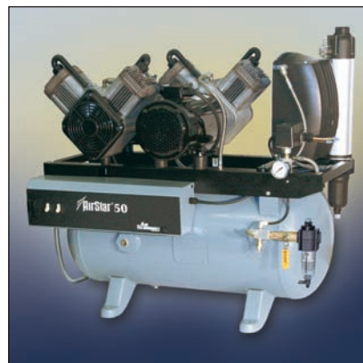
AirStar 50 with Membrane Dryer System